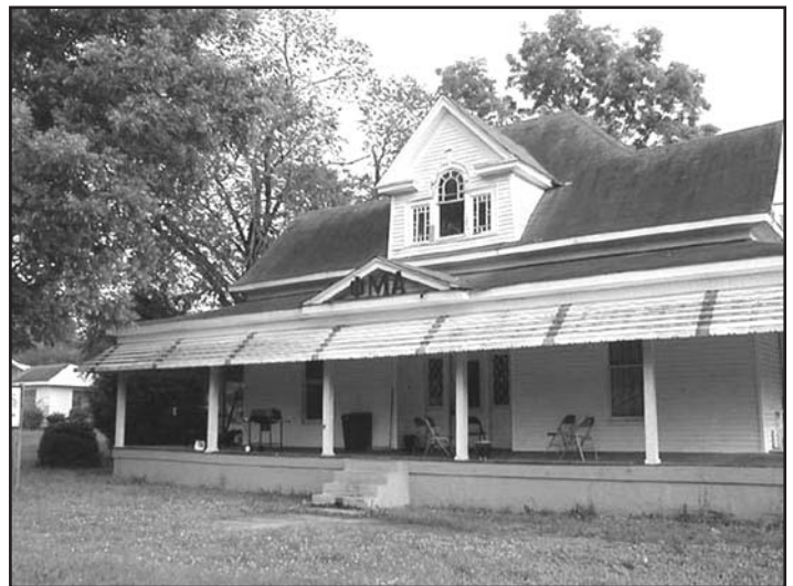
The current chapter house, purchased in 1994. The board of Musical Interest House, Inc. is trying to make improvements to the house.